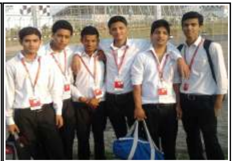
IHA STUDENTS AT F-1 RACE