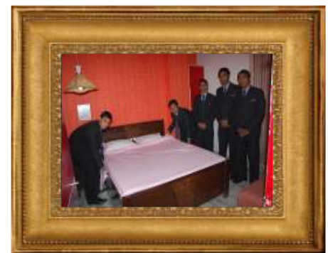
TRAINING GUEST ROOM