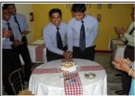
BIRTH DAY CELEBRATION