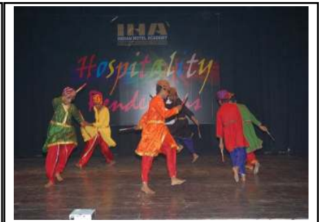
CULTURAL SHOW BY IHA STUDENTS