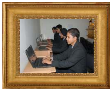
Wi- Fi CAMPUS