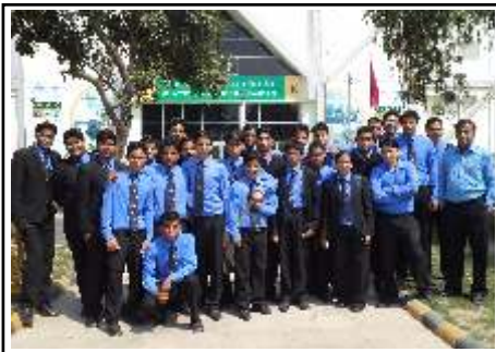
CULTURAL DANCE PERFORMANCE