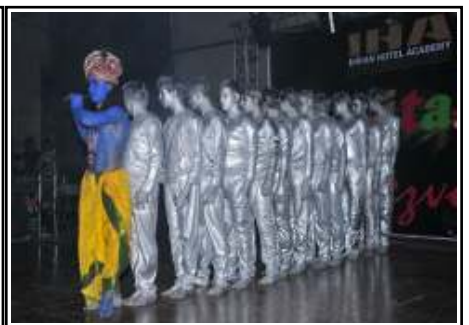
CULTURAL DANCE PERFORMANCE