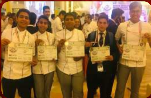
IHA Students Received Winning Medals in Indian Culinary Forum Chef Competition