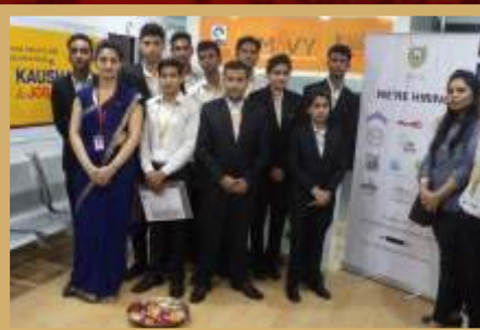
Job Mela at IHA