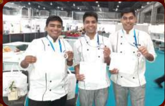
IHA Students Received Winning Medals at International Hospitality Expo Culinary Competition