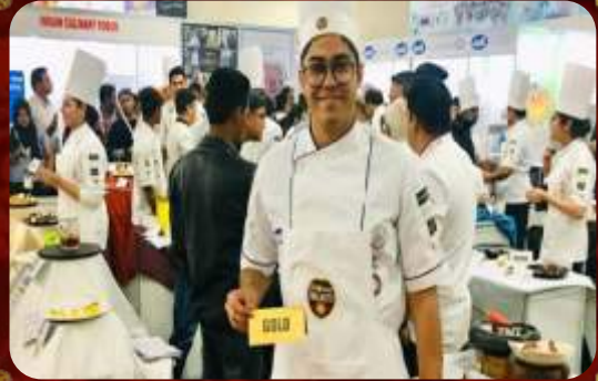
IHA Student Received Gold Medal in Chef Competition at Aahar, Pragati Maidan