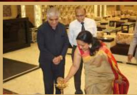
Awadh Food Festival