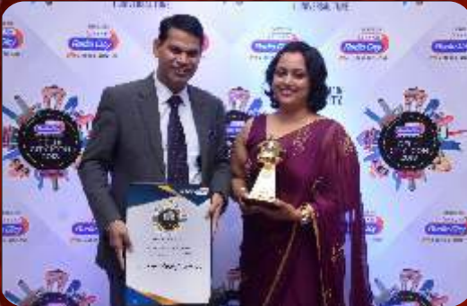
IHA Received Radio City Iconic Award for Excellence in Hospitality Education