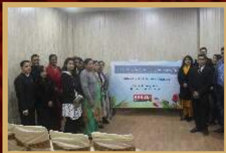
Thanks Giving Day