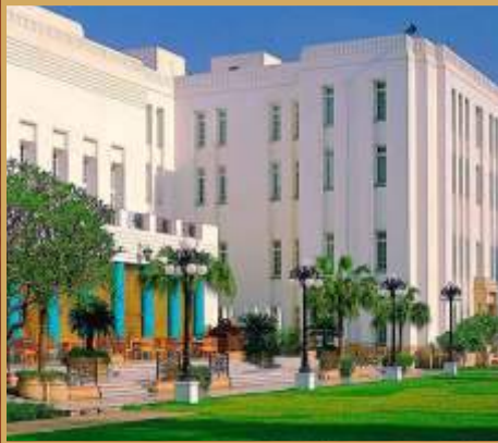
THE IMPERIAL New Delhi