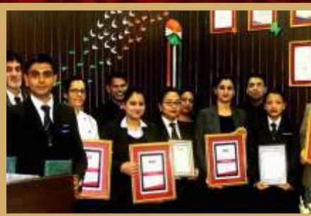
IHA Town Hall