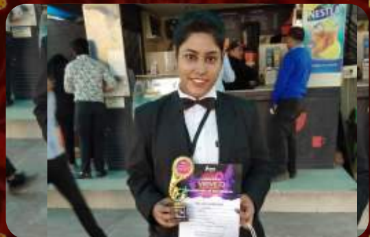
IHA Student won award in Bar Competition at JIMS