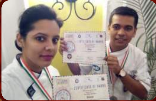
IHA Students Received Winning Medals in Indian Culinary Forum Chef Competition