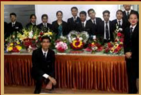
Flower Arrangement Competition