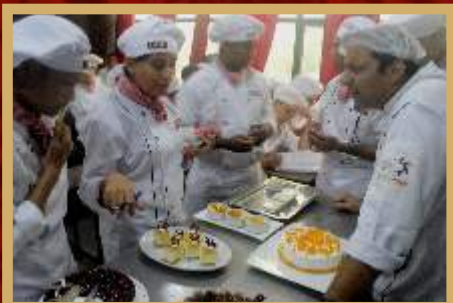
Expert Bakery Session