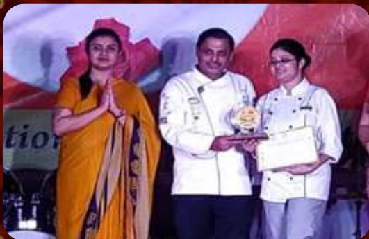
IHA Student Received Winning Trophy at Banarsidas Chandiwala Institute