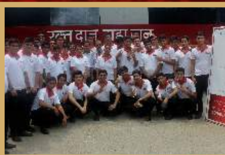
Blood Donation Camp at IHA