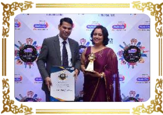
IHA Received Radio City Iconic Award for Excellence in Hospitality Education