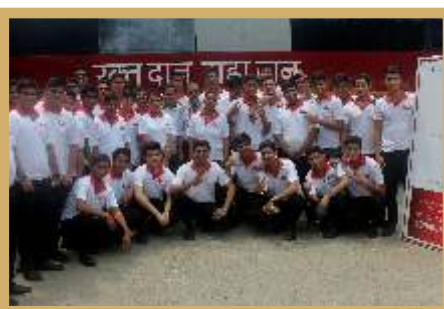
Blood Donation Camp at IHA