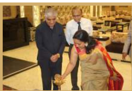
Awadh Food Festival