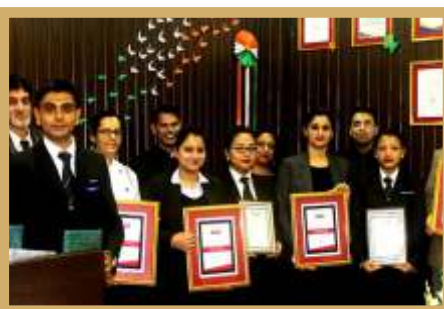
IHA Town Hall