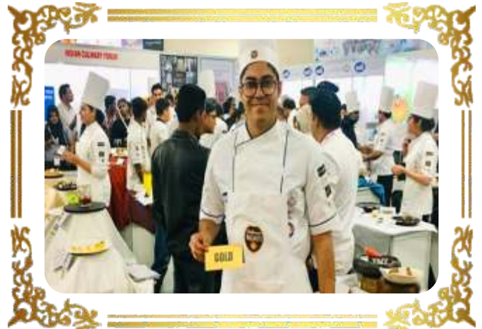
IHA Student Received Gold Medal in Chef Competition at Aahar, Pragati Maidan