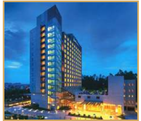
Radisson BLU HOTEL GREATER NOIDA