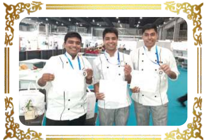
IHA Students Received Winning Medals at International Hospitality Expo Culinary Competition