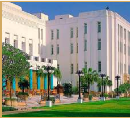
THE IMPERIAL New Delhi