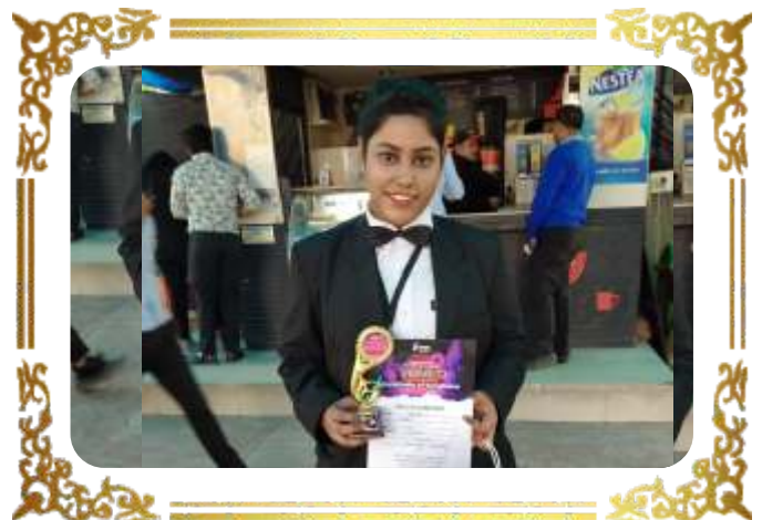
IHA Student won award in Bar Competition at JIMS