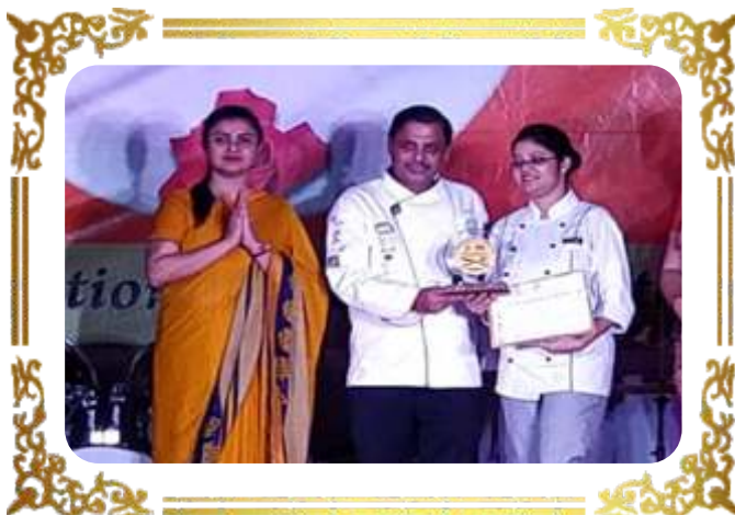
IHA Student Received Winning Trophy at Banarsidas Chandiwal Institute