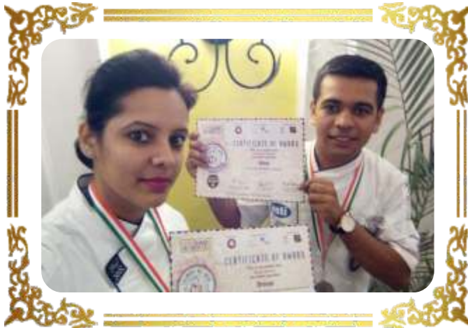
IHA Students Received Winning Medals in Indian Culinary Forum Chef Competition