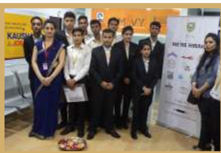
Job Mela at IHA