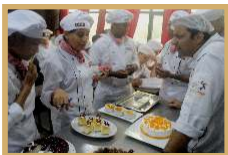
Expert Bakery Session