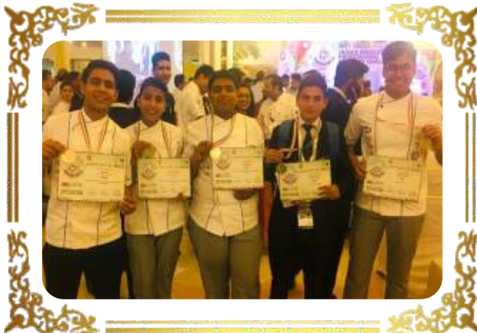
IHA Students Received Winning Medals in Indian Culinary Forum Chef Competition