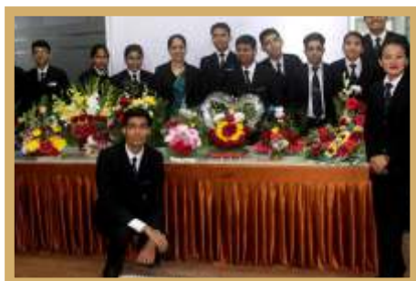
Flower Arrangement Competition